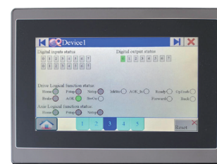
PT2 HMI here with CMZ library configured