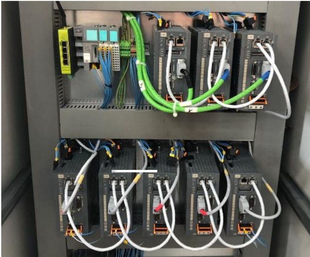
The robotufting cabinet with CMZ FCT640 motion controller and SBD brushless servodrives