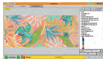
Carpets are created on a screen using specially developed software that allows designers to specify all of the necessary tufting parameters

The eight-axis control application was developed for CMZ's modular, Codesys-based FCT640 motion controller which uses EtherCat communications. Because of the machine's high-speed operation and heavy-duty working cycles, the control components were chosen for their ability to operate non-stop with long operating lives and low maintenance. ■